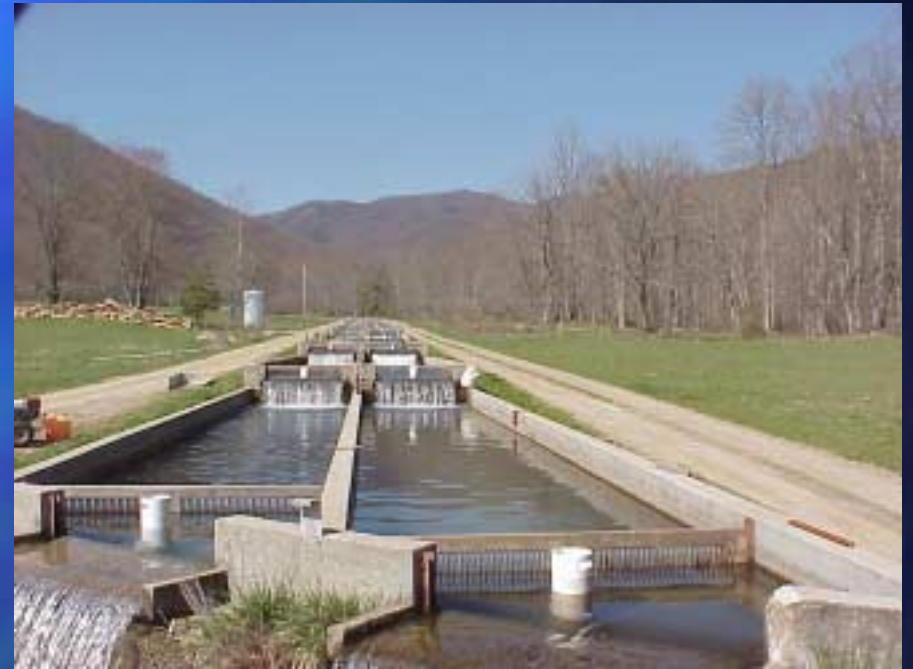
Trout Production “Raceway” Tanks