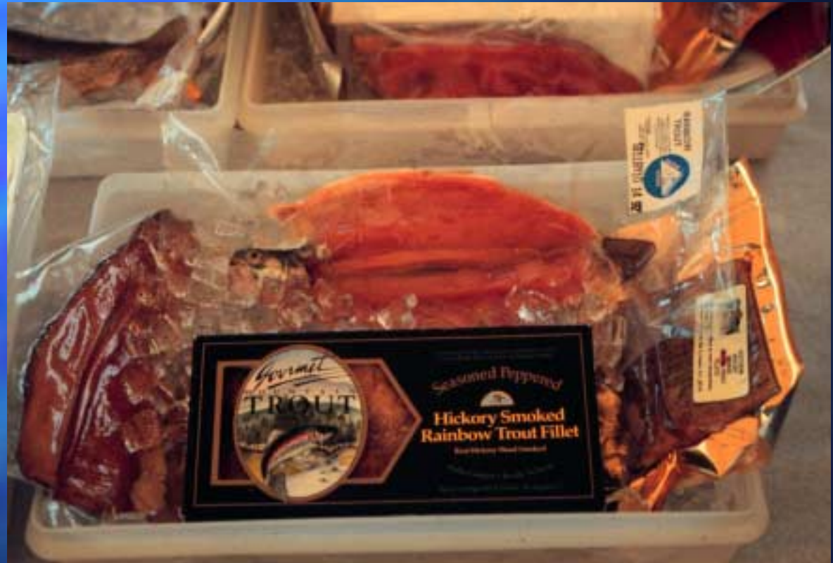
Value Added Trout Products