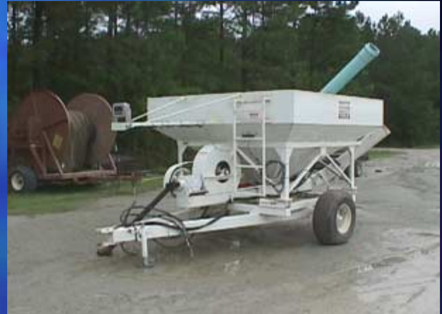
“Blow” Feeder used with Production Ponds